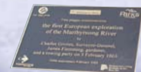
Plaque commemorating the bicentennial of the exploration of the maribymong river by Europeans in 1803 was placed in Pipemakers Park near the River.