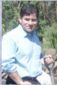
City of Maribymong Mayor, Joe Cutri lends a hand in the museum garden during a special community service day.