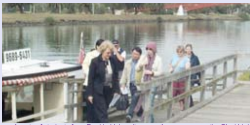
A party of students from Deakin University come the museum on the Blackbird for a workshop on how a community museum operates.