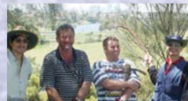
A group of men on 'Work for the Dole' project carrying-out garden maintenance.