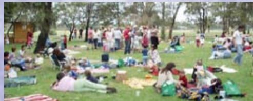
Community event organised at Pipemakers Park in conjunction with the Living Museum.