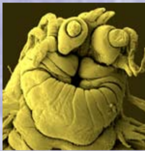
The wonder of microscopic life in the Maribymong mud is discovered as part of a special microscope survey carried out by WSL Laboratories for an exhibition being developed about animals in and about the Maribymong River.