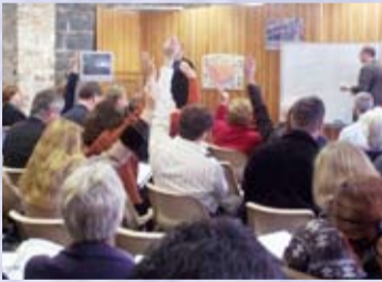
A forum on the future management of the Maribymong River organised by Maribymong City Council and hosted by the Museum.