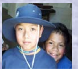
Visiting primary students enjoying their experience of local history and heritage at Pipemakers Park.

Melbourne's Living Museum of the West is a community museum which actively involves the people of Melbourne's west and others in documenting, preserving and interpreting the richness and depth of the region's social, industrial and environmental history.