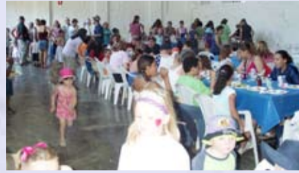
Aboriginal Santa arrives for the Gathering Place Christmas party at Pipemakers Park organised in partnership with The Gathering Place and Living Museum.