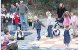
A family group enjoys the History of the Land Garden.