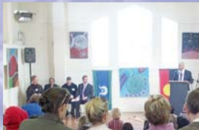
Launch of the Western Region NAIDOC Art event at the Incinerator in Moonee Valley.