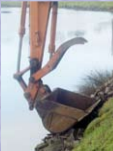
Melbourne Water upgrades the banks of the Maribymong as part of an environmental project running from the escarpment to the river organised by the Living Museum and funded by Envirofund.